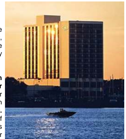
Hilton Houston NASA Clear Lake

The Reservation Deadline is September 25, 2006. Make your reservations directly with the Hilton at 281-333-9300. Be sure to identify yourself as being part of the Texas Electronics Association for this special room rate.